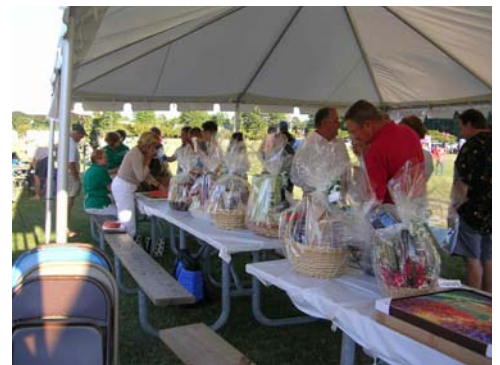
Raffle baskets and donated items.