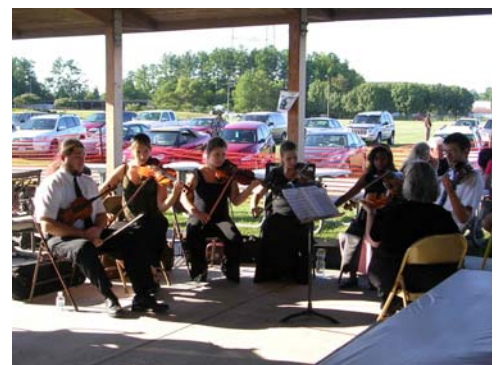
Twinklers to Sizzlers Suzuki Violins play as the public enjoys food and wine tasting. (Right)