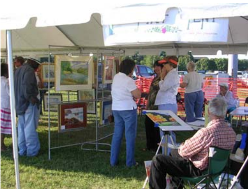
Visitors enjoy the Art Exhibit and talk with Artists of the Southside Artists Association. (Left)